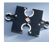
Male module (31864)